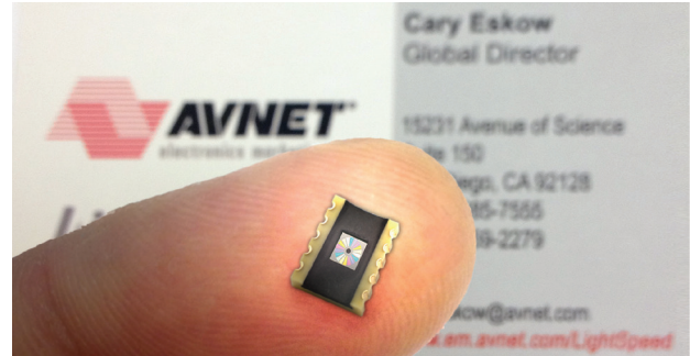
Figure 1 – A precision 6-channel multispectral sensor IC resting on my fingertip

This device is fabricated using stacks of optical interference filters (semi-transparent metalized thin films) layered over photodiodes. The filters allow